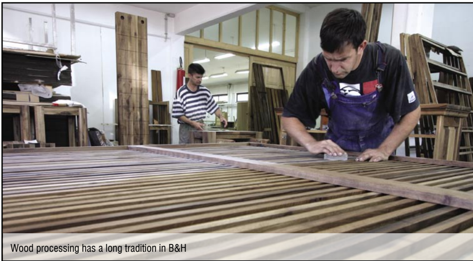
Wood processing has a long tradition in B&H