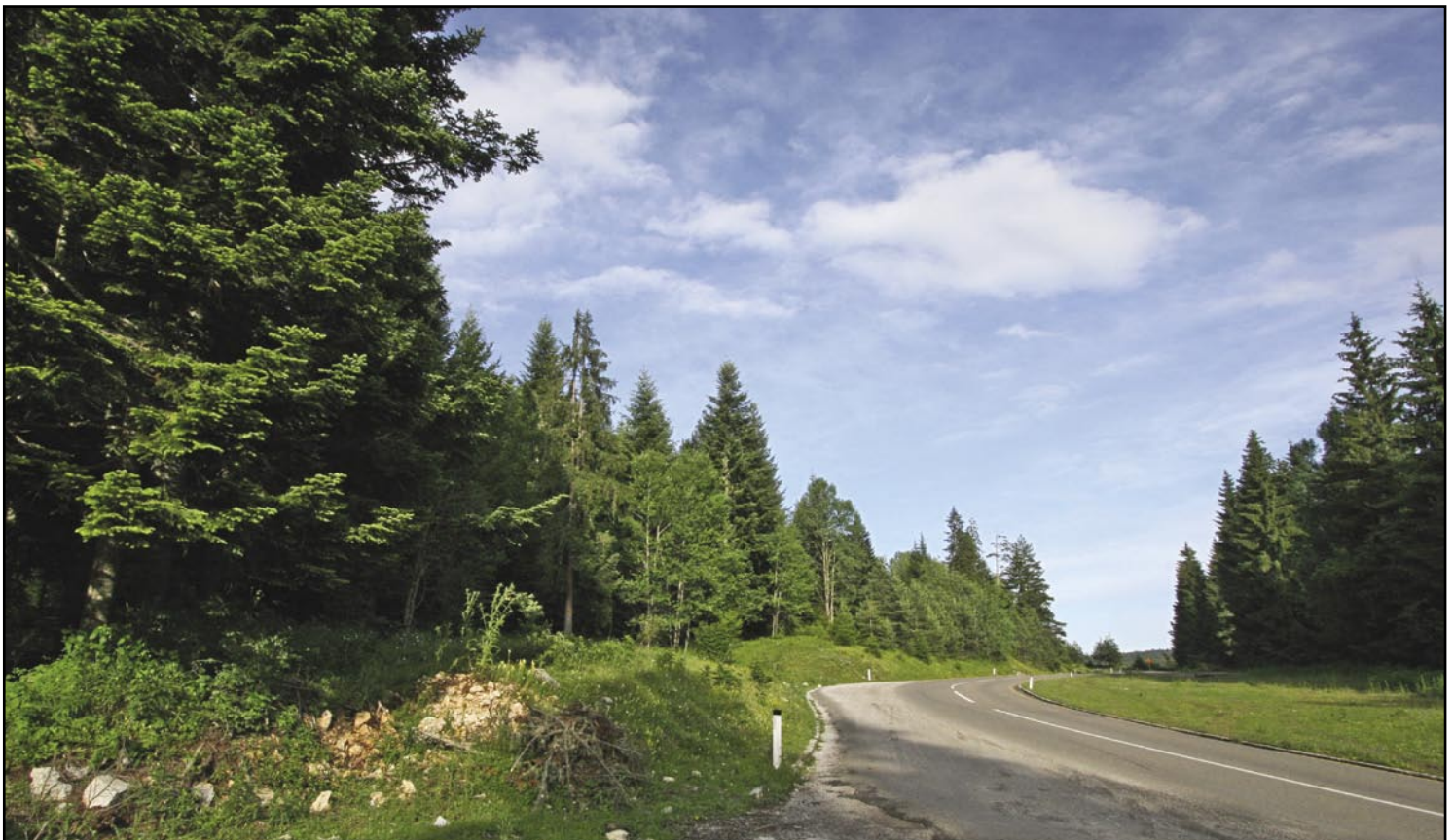
Bosnia and Herzegovina is rich with forests

http://europa.eu.int/comm/enterprise/furniture